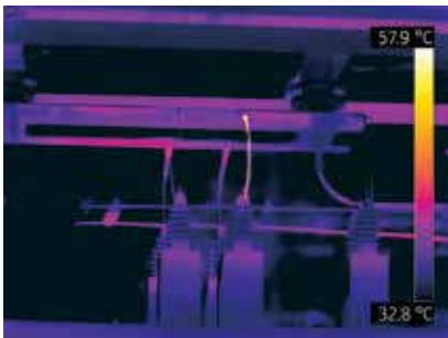
Hot power line transformer