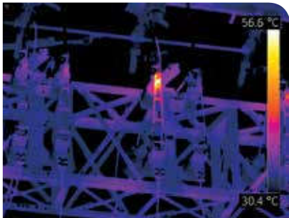
Overheating substation circuit breaker