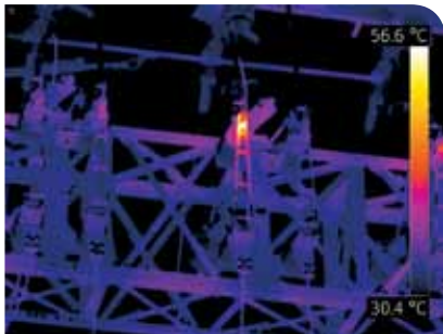
Overheating substation circuit breaker